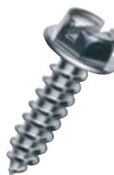
Drill-In Screws Type A, Single Thread