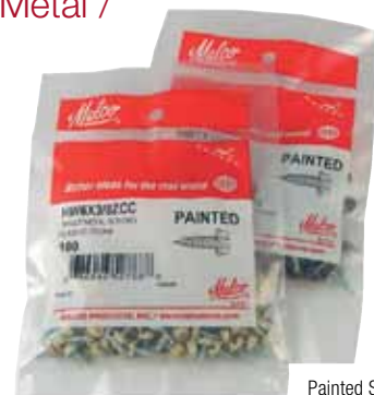
Packaged in Bags and Tubs.