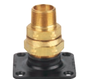
Termination Fitting with Square Flange