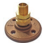
Termination Fitting with Bronze Flange